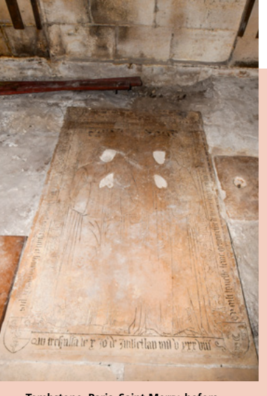
Tombstone, Paris, Saint-Merry, before...

Building on the success of previous years, the campaign has gone from strength to strength. In 2022, six new Michelin sites joined the scheme, bringing to 14 the number of facilities taking part, which is close to the maximum. In all, 93 works of art were identified, covering 11 départements and 7 regions of France. The finalists were subsequently singled out in an online ballot of employees. 14 works were chosen, one per location, all owned by municipalities or associations, and they will be restored with the aid of a 8,000 euros donation. The wide variety of the artefacts illustrates the richness of the French cultural heritage, be it religious, funerary or industrial. Among the items selected are a tombstone, a steam powered road roller, two Madonnas and child, a bell, a model of Angers cathedral and a mountainscape. •