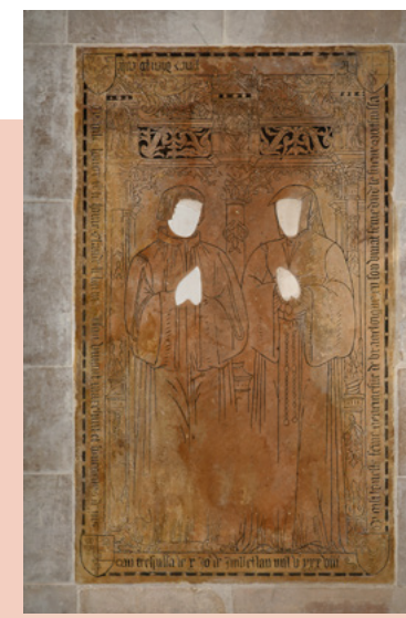
... and after restoration.

"THE CULTURAL HERITAGE OF OUR REGIONS IS A SHARED TREASURE. IT BELONGS IN EQUAL MEASURE TO ALL THOSE WHO KNOW IT AND CHERISH IT. THAT'S WHY THEY WANT TO PRESERVE IT TO PASS ON TO THOSE THEY